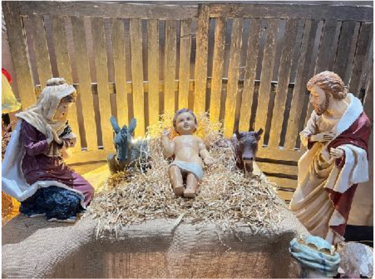
Jesus will not appear in the crib until Christmas