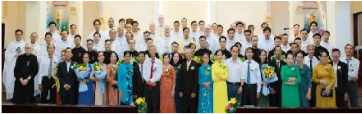
Parents and Passionist religious at last week's profession ceremony