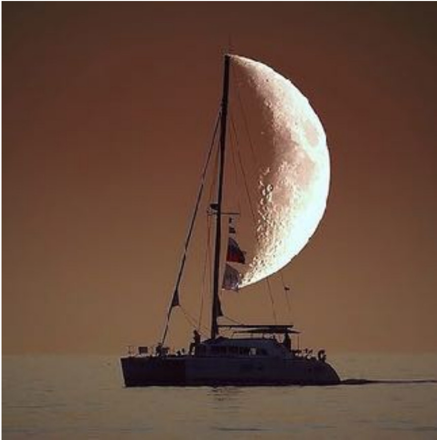
Being in the right place at the right time