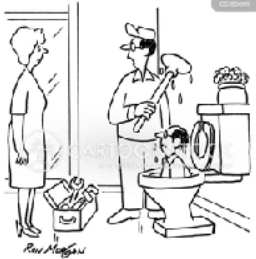
"I found the clog."