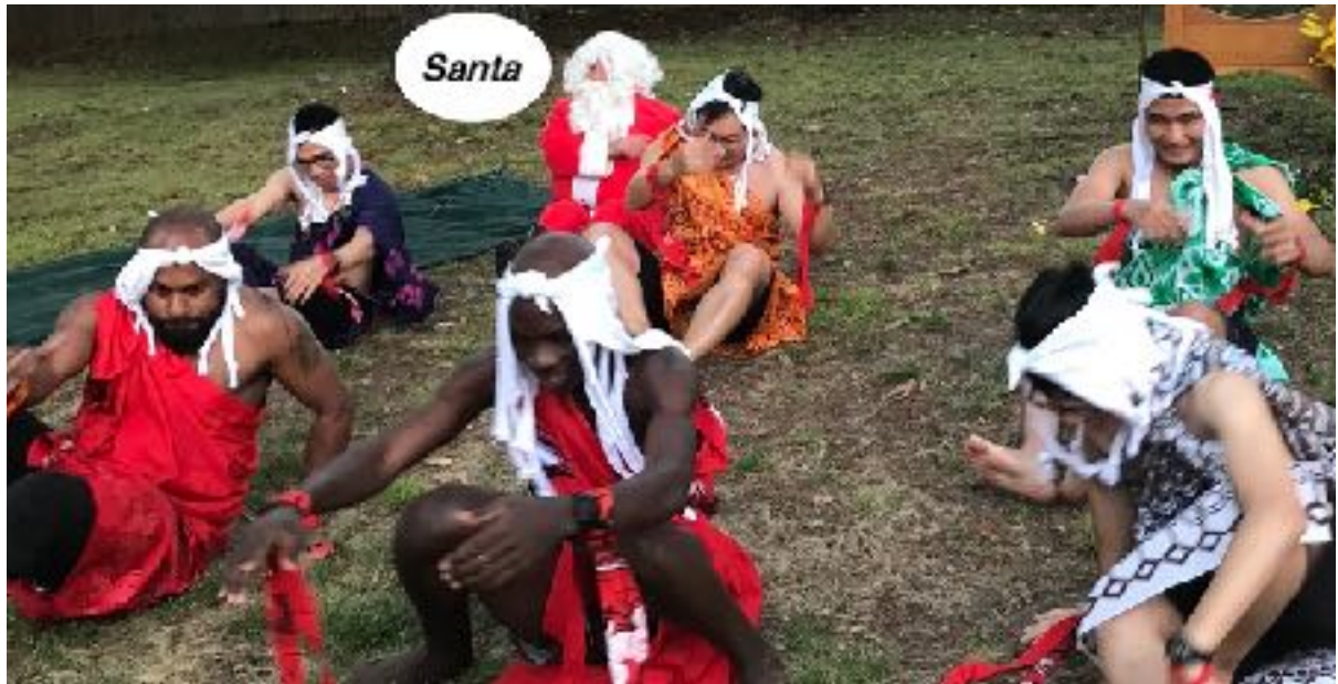
Some of the children....